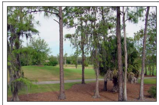
Rear View of Golf Course and Preserve

Although the information shown on this brochure is believed to be accurate, it is not guaranteed or warranted and should be verified.