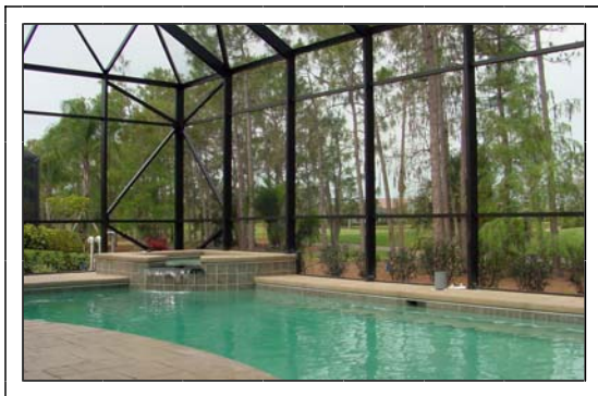
View of Heated Pool and Spa

Come see this beautiful, NEVER LIVED IN home with Golf Course and Preserve Views in Wildcat Run, a golf course and tennis community close to shopping and Interstate I-75. The large screened lanai and pool deck area has an oversized heated pool with spa waterfall flowing into the pool. The floors are large porcelain rectified tile everywhere except the bedrooms with a marble inlay in the foyer. The bedrooms have upgraded carpet. The kitchen has beautiful wood cabinets and Silestone quartz countertops. The outdoor cooktop area has a sink and quartz countertop. The master bath has cultured marble hydro-spa tub and cultured marble shower. Grohe plumbing fixtures are used throughout. The main living areas have high volume ceilings with crown molding. (NOTE: This is not a short sale or bank foreclosure, so make an offer and get a response right away.)