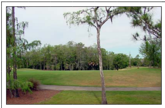
Rear View of Golf Course and Preserve

Come see this beautiful, NEVER LIVED IN home with Golf Course and Preserve Views in Wildcat Run, a golf course and tennis community close to shopping and Interstate I-75. The large screened lanai and pool deck area has an oversized heated pool with spa waterfall flowing into the pool. The floors are large porcelain rectified tile everywhere except the bedrooms with a marble inlay in the foyer. The bedrooms have upgraded carpet. The kitchen has beautiful wood cabinets and Silestone quartz countertops. The outdoor cooktop area has a sink and quartz countertop. The master bath has cultured marble hydro-spa tub and cultured marble shower. Grohe plumbing fixtures are used throughout. The main living areas have high volume ceilings with crown molding. (NOTE: This is not a short sale or bank foreclosure, so make an offer and get a response right away.)